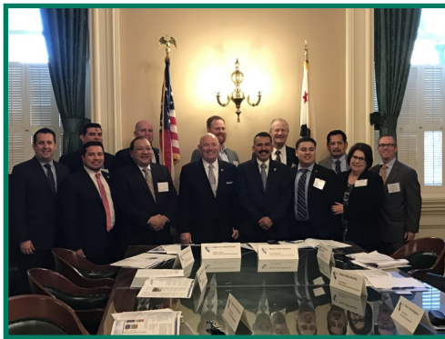
Valley Voice delegation in the State Capitol -2017

The trip is part of an annual program known as Valley Voice, a collaborative effort that identifies the region’s legislative priorities and provides the opportunity to advocate for policies in Sacramento and Washington, DC that will benefit the San Joaquin Valley. For more information about Valley Voice visit www.sjvcogs.org .